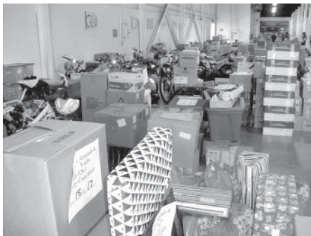
Bountiful gifts filled both buildings at the OC Fair & Event Center