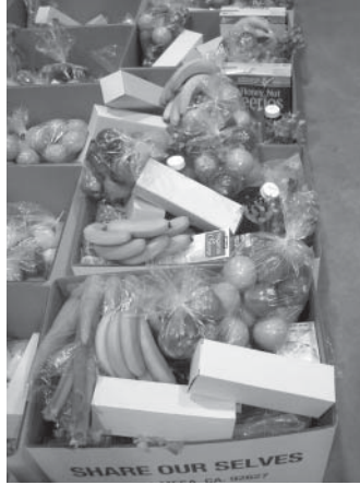
Beautiful fresh produce and food is packed for deserving families