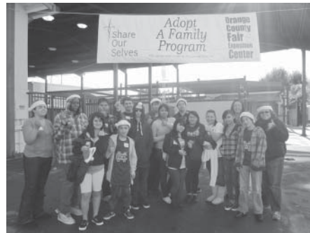
Costa Mesa High School volunteers