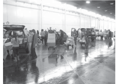
Donors deliver gifts and food and their cars are unloaded by eager volunteers