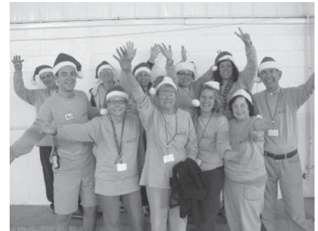
The hardworking 2010 Adopt A Family Committee who volunteered more than 1,900 hours of service to the program